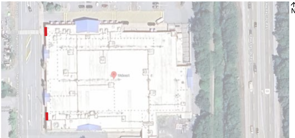
■ Artwork site location

The murals are scheduled to be completed by July 31st 2026, to coincide with the completion of the store's overall renovations. The artists' availability to complete the project within this timeframe will be a consideration when reviewing artist submissions.