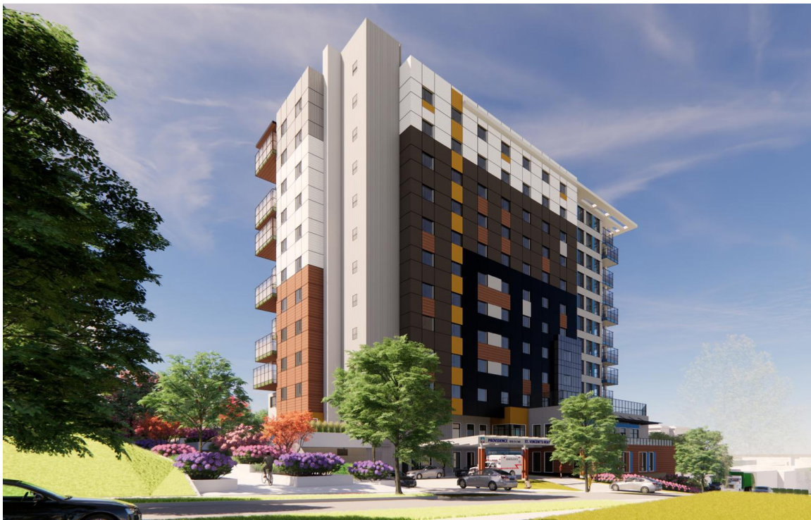
Rendering of the new St. Vincent's Heather long term care home

The home is designed with community in mind, featuring 20 households each accommodating 12 residents in single-bed rooms with wheelchair-accessible ensuite bathrooms, plus common spaces that replicate the warmth and comfort of a typical home. On the main floor, St. Vincent's Heather will feature community spaces including primary care services, All Nations Sacred Space for Indigenous residents and visitors, sacred space for worship and reflection, community garden, childcare centre, and various amenities that will enable residents to live vibrant and active lives while staying connected to their community.