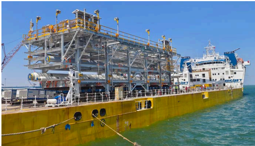
PIPERACK MODULES ON SHIPPING VESSEL

The modules will then be transported into place on site using Self-Propelled Modular Transporters (SPMTs)—motorized vehicles equipped with hydraulic lift systems—and lifted into final position using large cranes. Throughout this process, Skwxwú7mesh Úxwumixw Indigenous Monitors will be present to oversee adherence to SNEAA and Management Plan commitments.