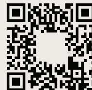
Jotform QR Code