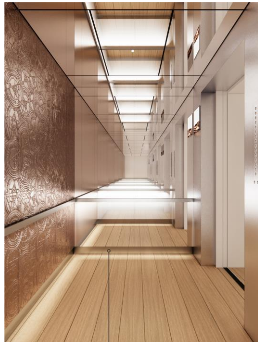
Side View of Elevator Cab Feature Wall