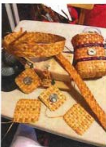
xpay tahím - Cedar Weaving