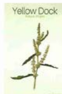
Leich' mamkw'utsin - Yellow Dock