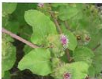
Mamkw'utsin - Burdock

Winter months were also spent in the longhouses where our people would do story telling, singing and dancing.