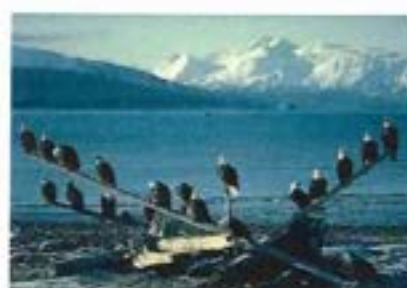
Sp'ákw'us - Eagles