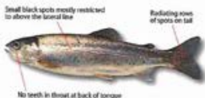
syuykw'úlu7 ~ syúykw'ula Rainbow Trout