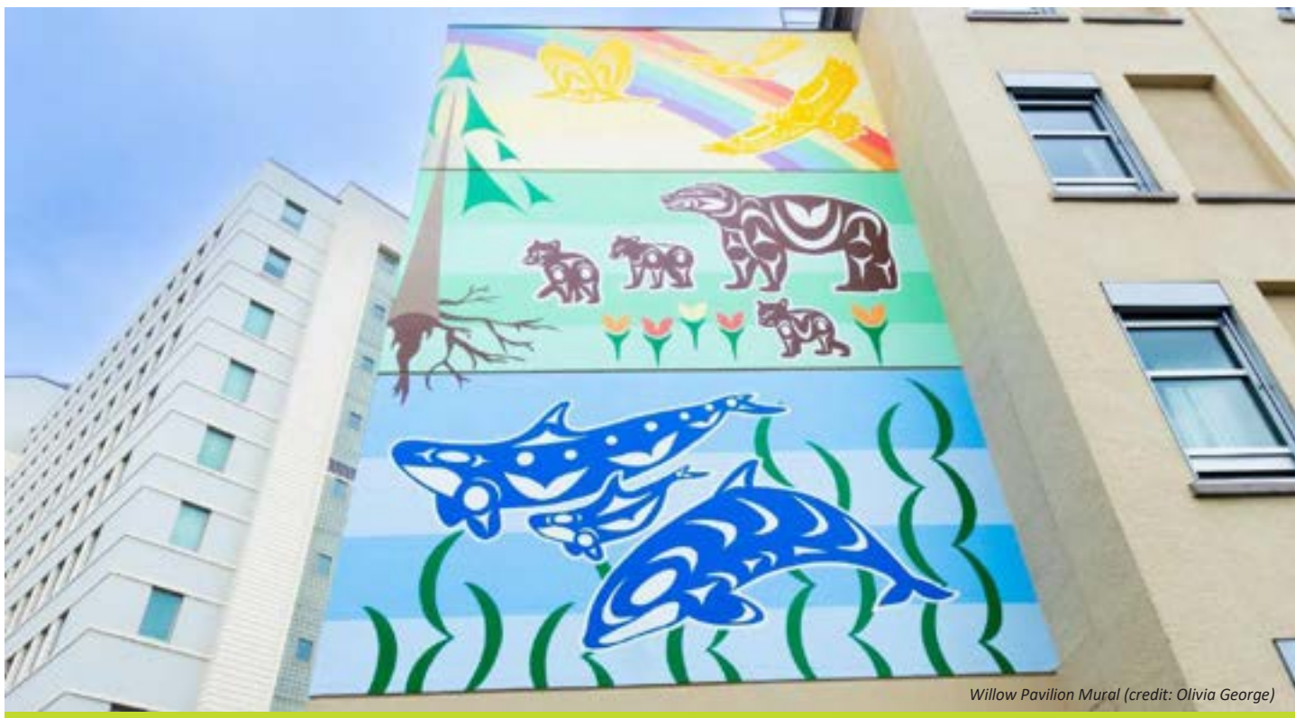
Willow Pavilion Mural