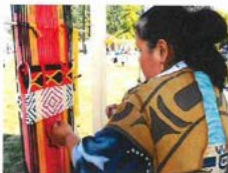
lhenlhént Wool Weaving