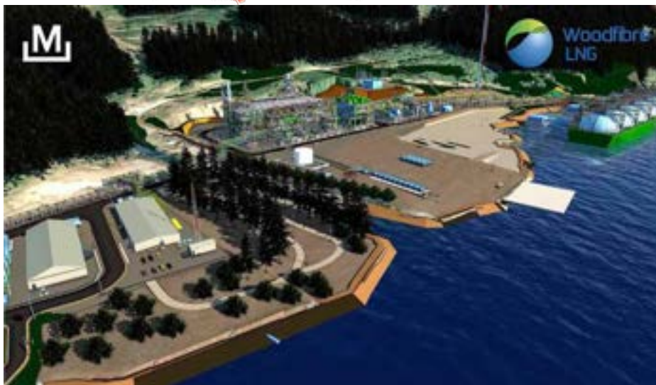
Future WoodfibreLNG site rendering photo

Date & Time: February 15 from 12:00- 3:00 pm