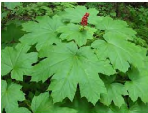
Ch'átyay' Devil's Club

Has your cultural use on our traditional territories been impacted in ANY way by the current pre-construction activities that are taking place? Please report immediately to 778-966-1117.