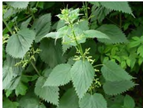
Ts'exts'íx Stinging Nettle

Readers are reminded that all back-issues of these newsletters to June 2019 are available at squamish.net/woodfibre-Ing .