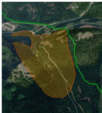
Stawamus Síiyamin ta Skwxwú7mesh boundaries, with planned pipeline route in green.

There will be no construction in this site, but there will be construction vehicles using the forestry roads that already run through the site. There will also be construction near the edges of the site. The site visit was helpful to understand where sight lines, noise, or access to the river might relate to the pipeline route.