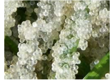
Ch'émesh - herring roe

We are looking for community members that would be interested in taking part in Ch'émesh (herring roe) harvesting in Spring 2022. Or if you will already be harvesting, if you would be willing to provide some roe for testing. We would like to harvest from near Swiyát , and from other areas for comparison. Samples will be given to WLNG to test if the Ch'émesh shows signs of pollution contamination, and if so whether there are differences between sites.