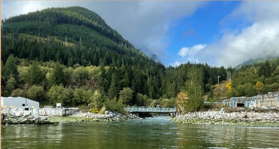
Marine Food Sampling at the mouth of Mill Creek, October 2021