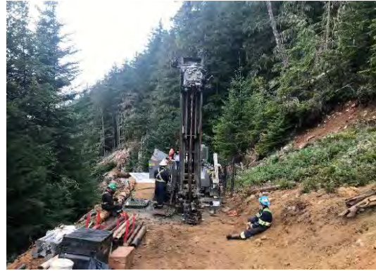
Drill rig for geotechnical work

This is planning-stage work in advance of potential construction in 2022 (assuming all pre-construction environmental conditions are met).