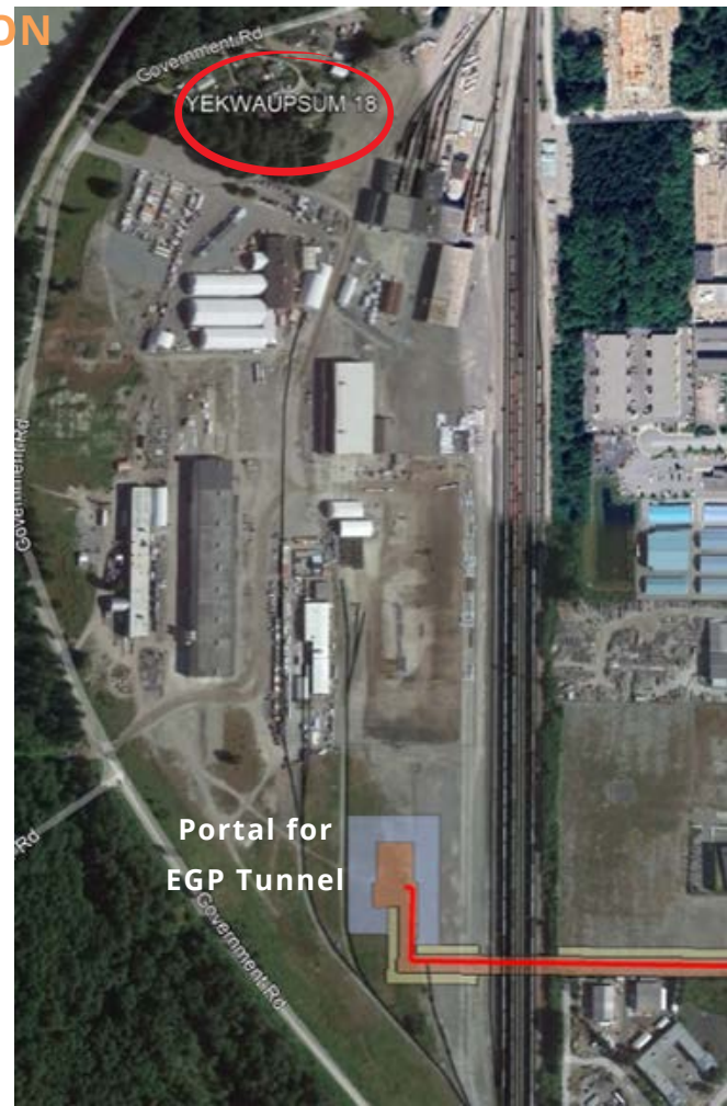
Workyard area and tunnel portal entry (red)