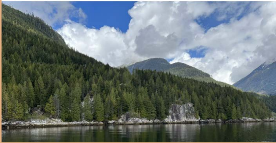
Proposed area for new forestry access dock behind Swiyát (Woodfibre)