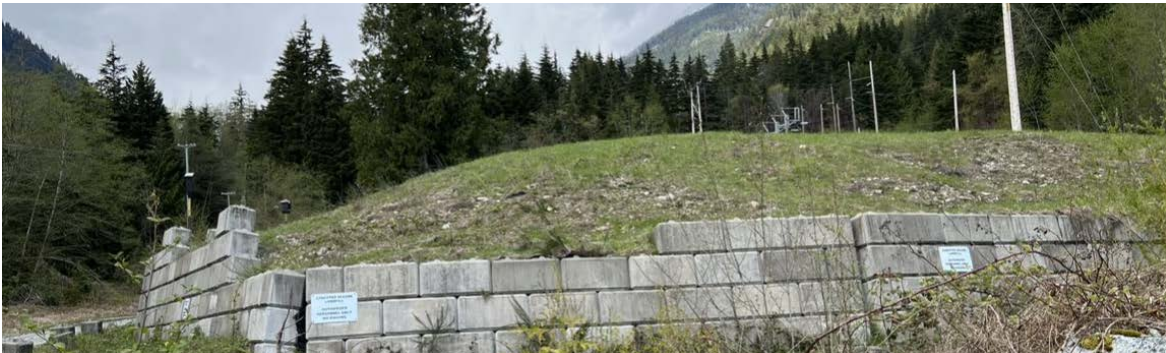
Current image of landfill at Swiyát, April 2022.

Roughly 20 Plans require Skwxwú7mesh Uxwumixw approval. This spring, we have been working with FortisBC’s environmental team on many of the priority Plans required before construction. This is a huge amount of work. We anticipate similar engagement ramping up with Woodfibre LNG later in 2022.