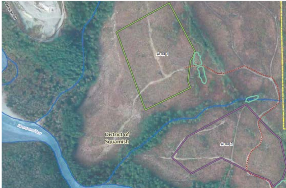
Proposed camp locations (Lafarge Sites)