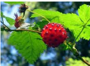
Yetwánaý - Salmonberries

Along the FortisBC pipeline route, there is a much higher volume of foods and medicines that could be harvested! We have done some high level inventory work of what is available in 2020 and 2021.