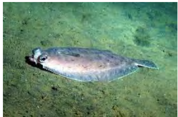
Lhémkw'a - Sole