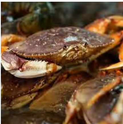
Ay̓x - crab