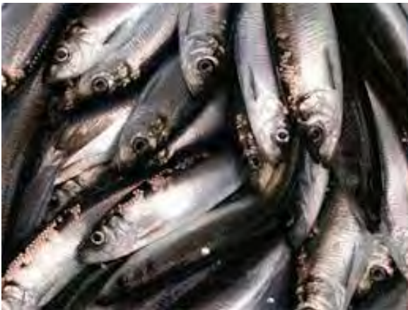
Slhawt' - herring