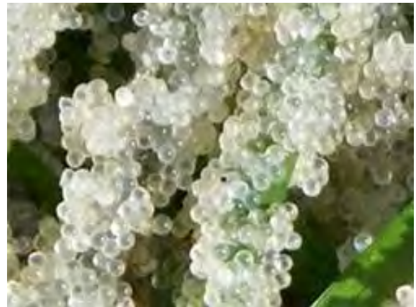
Ch'émesh - herring roe