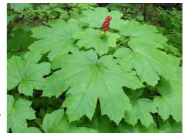
Ch'átiyaý - Devil's Club

If the pipeline proceeds to construction in 2022, clearing will occur in segments through 2024. We intend to ramp up efforts for salvage or harvest, in line with construction timing. If you would like to know more about this topic or would like to be involved, please get in touch.