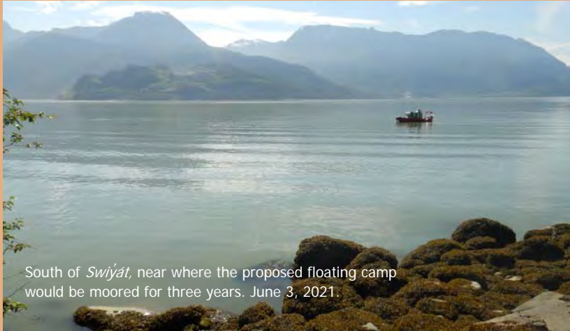
South of Swiyát , near where the proposed floating camp would be moored for three years. June 3, 2021.