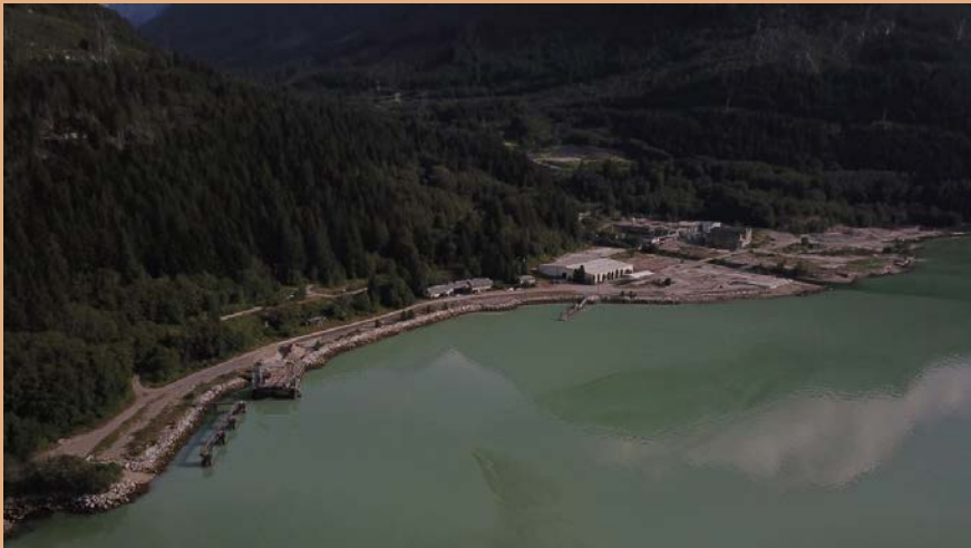
Aerial view of Swiyát, September 2021