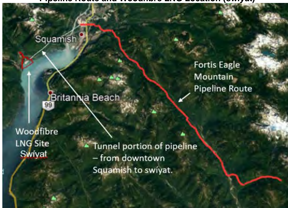
Pipeline Route and Woodfibre LNG Location (swíyat)