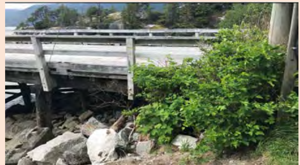
Existing dock (photo taken by Keystone Environmental for Woodfibre LNG).

We reported in January that Woodfibre LNG was proposing to construct a crew transport dock at Darrell Bay. That proposal is being re-evaluated to see if WLNG can use the existing dock at Darrell Bay instead. We will provide further update in March 2020.