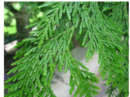
Xapayayachwx Red Cedar Bough