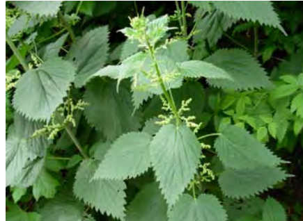
Ts'exts'ix Stinging Nettle