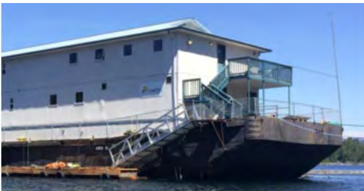
Example floating camp ( https://landseacamps.com )

Issues of interest include fish habitat, avoiding pollution, safety for all workers and special focus on women, pandemic management, plans for off-shift workers in and out of town, drug and alcohol concerns. Thank you to everyone who responded to our survey to help refine the priority issues!