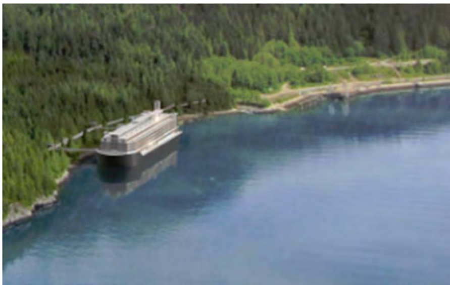
Artist rendering of the proposed floating camp ("floatel") at Woodfibre

Since June 2019, the Squamish Nation's environmental team has been posting monthly progress updates through the community newsletters. We have included a longer newsletter this month, since it has been awhile since we recapped some of the big picture items!!