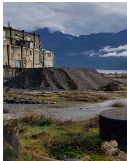
Site cleanup, November 2019