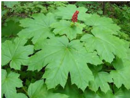
Ch'átyay Devil's Club

Typical government permits do not address plants of cultural importance to Squamish Nation. This may include plants used for medicines, food, or ceremony. Through the Squamish Nation conditions of approval, FortisBC has also provided resources for Squamish Nation to inventory plants along the pipeline route and identify ways to harvest or relocate plants. This work will be ongoing in spring and summer of 2021 and likely 2022. (Similar work will apply for the WLNG site, although that requires much less clearing).