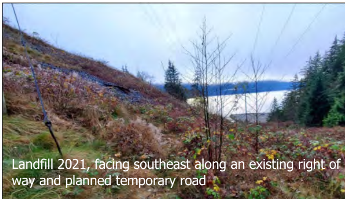
Landfill 2021, facing southeast along an existing right of way and planned temporary road

Please report immediately to 778-966-1117.