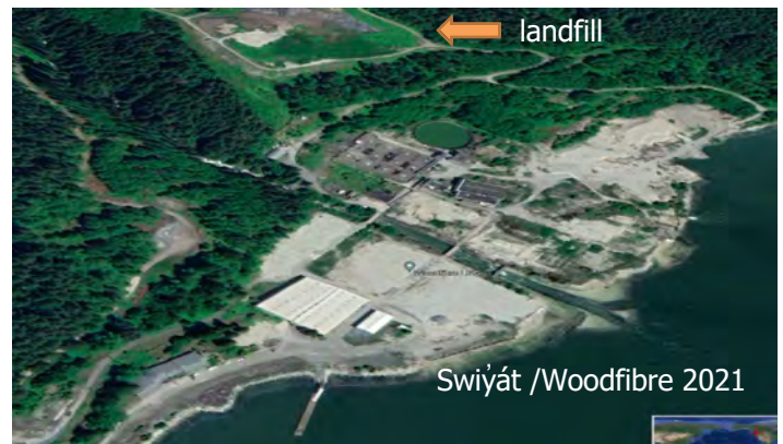
Swiyát /Woodfibre 2021

Readers are reminded that all back-issues of these newsletters to June 2019 are available at squamish.net/woodfibre-Ing .