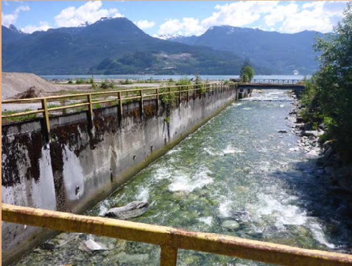
Mill Creek at Woodfibre. Habitat restoration of this creek is planned as part of the Squamish Nation environmental conditions.