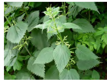
Ts'exts'ix -Stinging Nettle