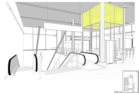
Potential Art Location B: Elevator Enclosure