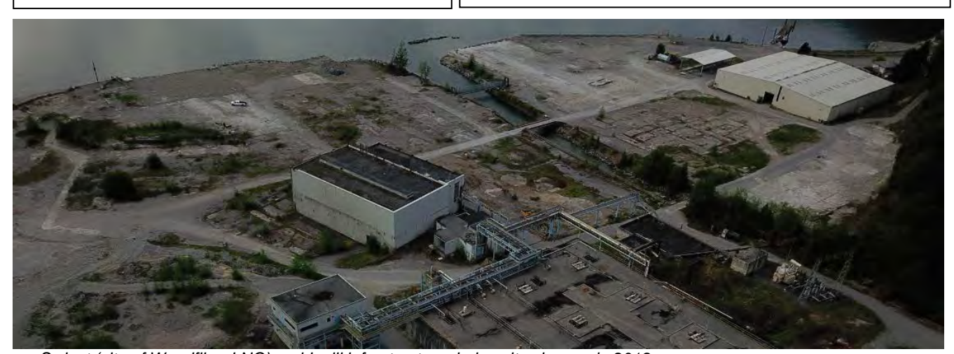
Swiyat (site of Woodfibre LNG) - old mill infrastructure during site cleanup in 2019

The amendment application (see page 1) will unfold over the next 6 to 8 months with review of technical reports and community engagement.