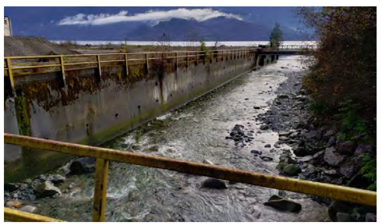
Mill Creek – previous site development has left minimal riparian (streamside) vegetation and concrete walls instead of banks, but it still supports salmon spawning.