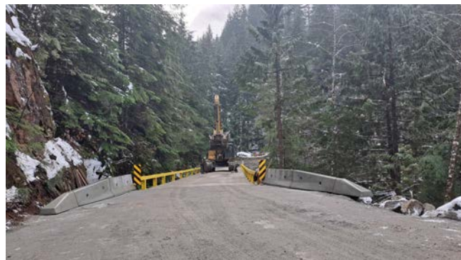
Demobilization of equipment at Stá7mes Bridge, December 2022

This 3 month project was successfully completed in December and all access roads are now open.