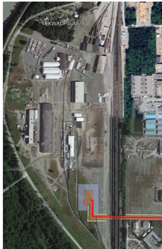
Workyard area and tunnel portal entry (red)