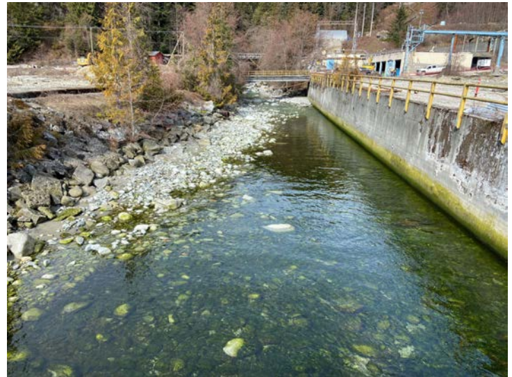
Mill Creek, Site Visit - March 2023