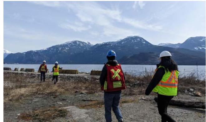
Environmental Working Group & Woodfibre reps, Site Visit - March 2023