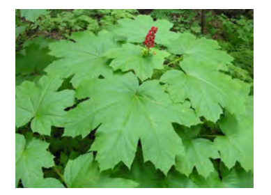
Ch'átiyay -Devil's Club

Through this project we will be looking at ways to harvest and/or transplant as much of the traditional edible and medicinal vegetation along the EGP route as possible prior to its completion.