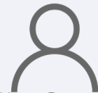
Non-Status (Métis OR Native American)