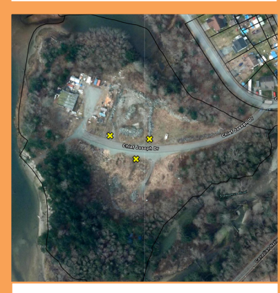
St'á7mes (Stawamus IR No. 24)